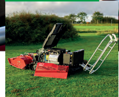
Easy access to engine compartment

Access to the engine compartment of the RC-1000s is both quick and easy, requiring no tools. The machine is designed with removable cantilevers and sides, making it even simpler to perform necessary maintenance and cleaning. This ensures minimal downtime and maximizes machine uptime and efficiency.