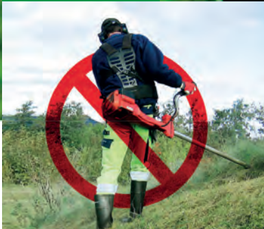
Minimise sick leave

Removing the operator from the machine avoids injuries and uncomfortable postures, which not only protects employee health but also ensures a more efficient work process. RC-1000s is a solution that prioritises the health and safety of your employees.