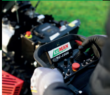
Ergonomic and uninterrupted operation

The RC-1000s comes with two rechargeable batteries that can be charged directly on the machine during use, ensuring uninterrupted operation. The ergonomic remote control gives you control of the machine from up to 150 metres away.