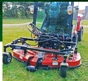
Rotary mower GMR Powerful grass cutter for efficient work. Cutting height and tilt-up controlled hydraulically. Cutting width of 1530 mm.