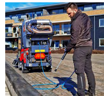
High-pressure washer Rediger High-pressure washer. With the 10-metre-long hose-pipe and 120-litre tank capacity, the pressure washer can be used continuously for 20 minutes. Automatic hose reel.