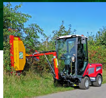
Multi-trimming hedge trimmer Offers a precise and uniform result, and cuts and shreds the material in one go. Change sides of the trimmer hydraulically. Cutting width 1300 mm.