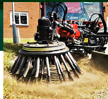
Weed brush with suction device Put an end to pesticides and other environmentally harmful substances. Remove and collect weeds in just one operation, so you don't have to double the work.