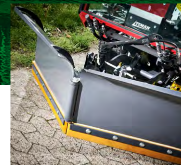
V-plow The 3 hydraulic settings enable you to clear large amounts of snow and ensures free and safe passage.