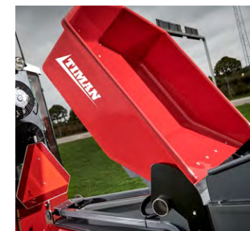
Tipping trough The tipping trough can be emptied hydraulically into the spreader while driving. This provides double the capacity. Advantageous in combination with the Combi Spreader CS-200.