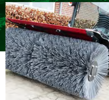
Sweeping roller The hydraulic settings of the sweeping roller with built-in floating position and parallel displacement makes it suitable for sweeping all year round. 1,200 mm width, Ø 550 mm.