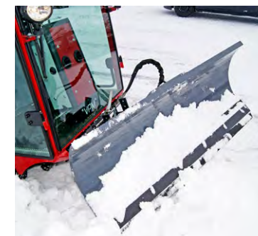
Dozer blade The tool has a working width of 1350 mm and offers great capacity for great amounts of snow. Supplied as standard with a safety tilt and rubber edge.