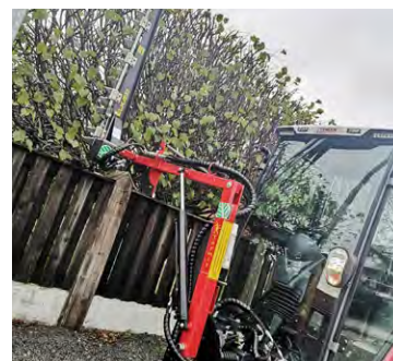
Hedge trimmer The hedge trimmer offers a precise and uniform result for hedges, bushes and plants close to the ground. Cuts both horizontally and vertically.