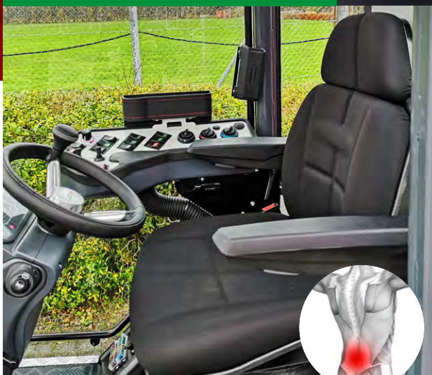
Fully adjustable driver's seat

Forget about hip and back pain. Height adjustment, lumbar support and ergonomic design guarantees maximum comfort.