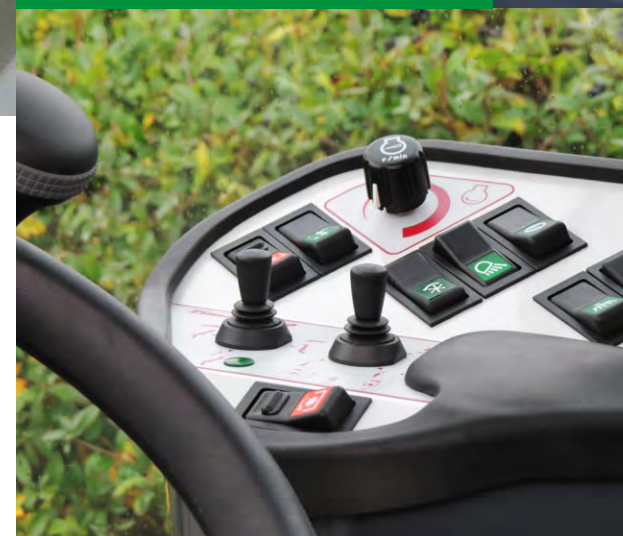
Full control at hand

The Timan 3330 control panel has been developed together with those who operate the machine on a daily basis. Cruise control, electronic hand throttle and Stop & Go are standard features of the machine.