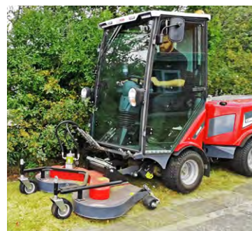
Rotary mower 1350 Grass cutter with heart-shaped blade cover allows you to cut right up to lampposts etc. Cutting width of 1350 mm.