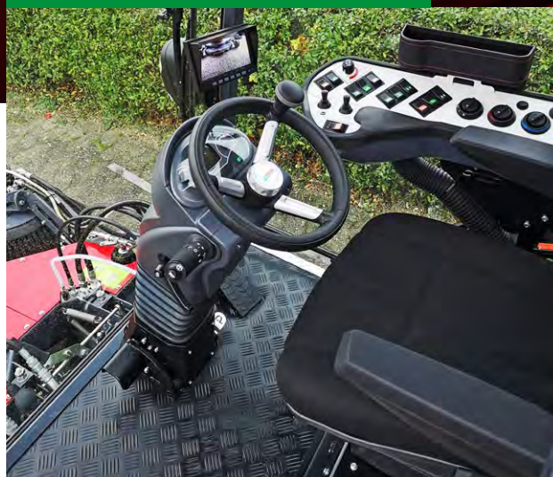
Low noise level and plenty of space

Forget hearing protection and enjoy your music. Gone are the days of stressful and uncomfortable work with just 68 dB at 2,600 rpm in the spacious, air-conditioned cabin.