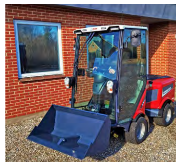
Hydraulic bucket No more awkward postures and heavy lifting. Use the bucket to spread gravel, sand and wood chips.